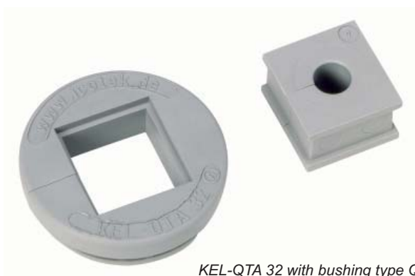
KEL-QTA 32 with bushing type QT

KEL-adapter for attachment housings can be snapped onto attachment housings for heavy connectors. It is available in size 16 (-pole connectors) and 24 and has two bore holes with a diameter of 32mm and, in addition, in size 24 one hole with 20mm diameter.