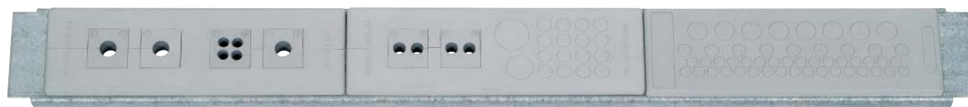
Example of equipped plate